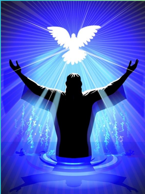
Son of God